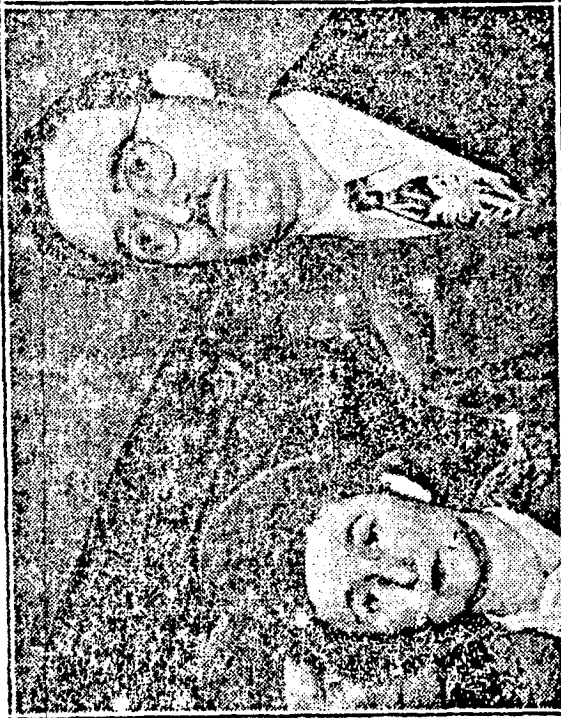
Mr. and Mrs. Julius Rosenberg—lose appeal.